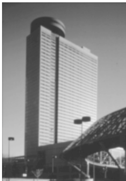
The Hyatt Regency Crown Center